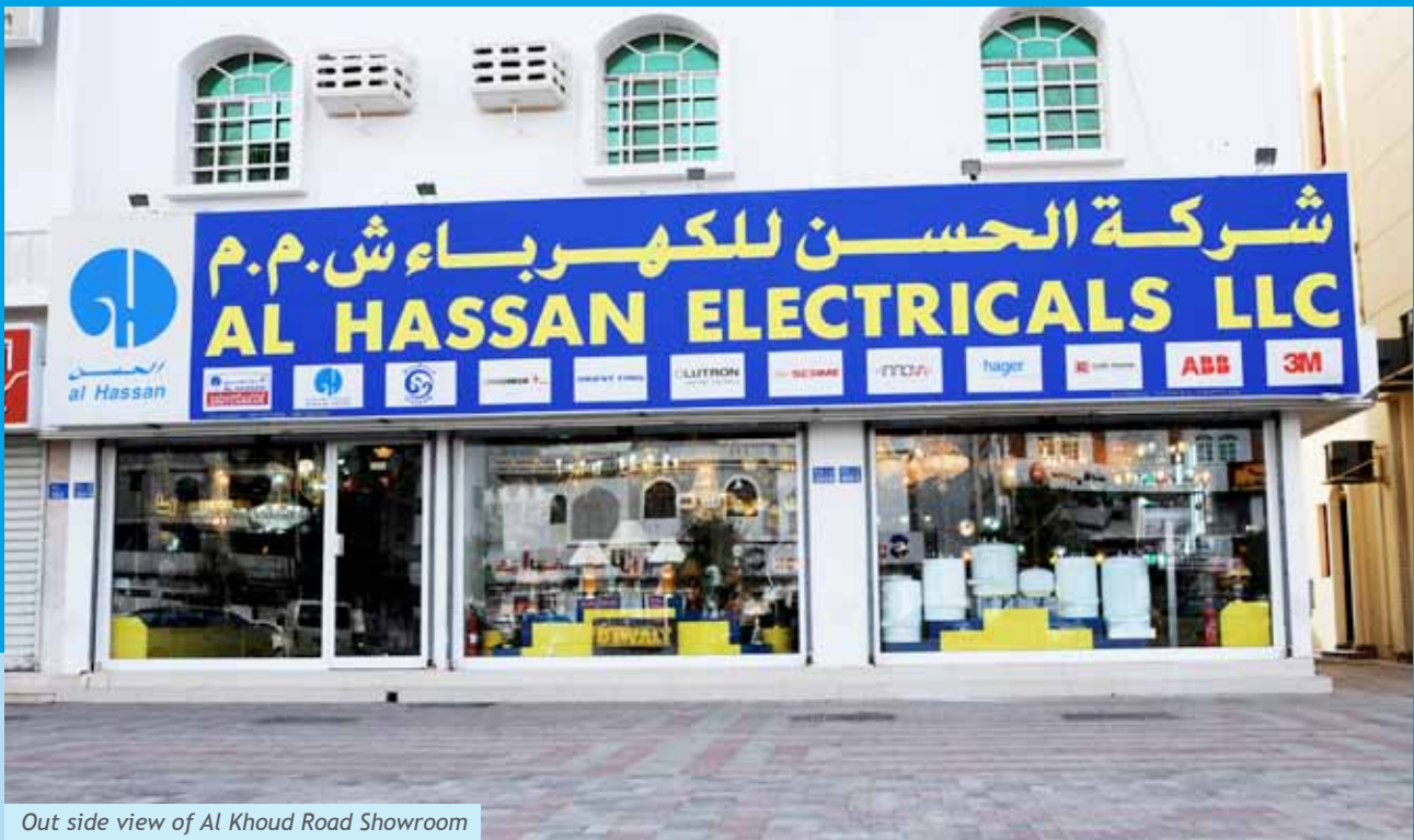
Out side view of Al Khoud Road Showroom