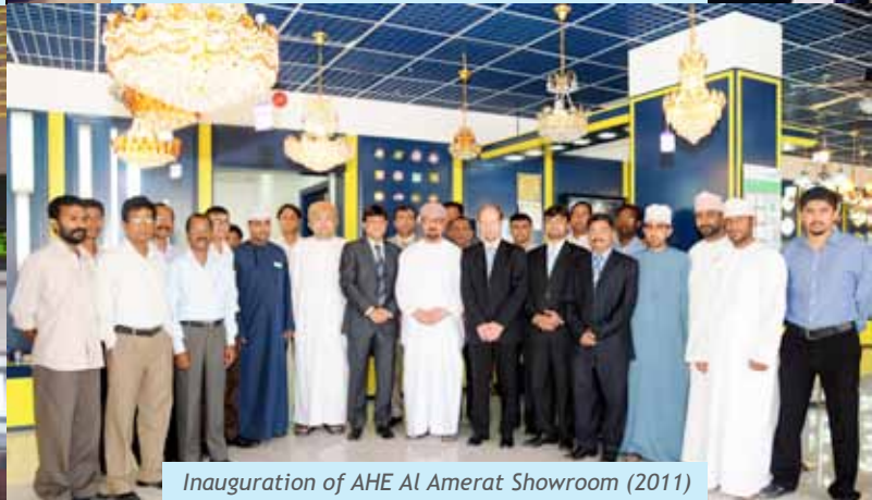
Inauguration of AHE Al Amerat Showroom (2011)