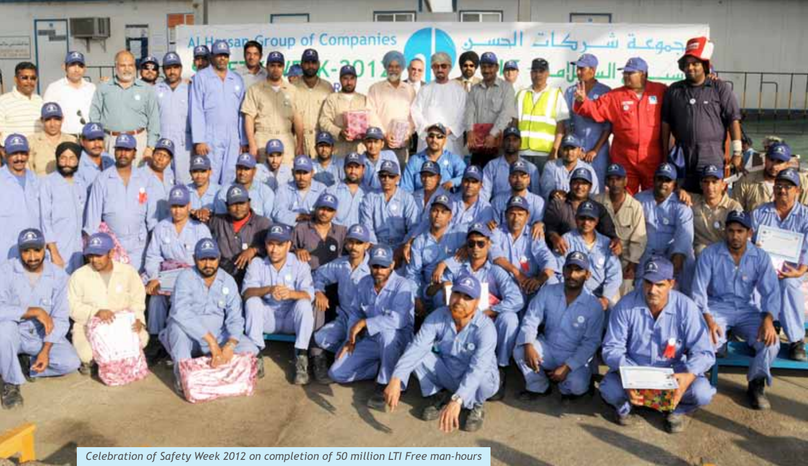
Celebration of Safety Week 2012 on completion of 50 million LTI Free man-hours