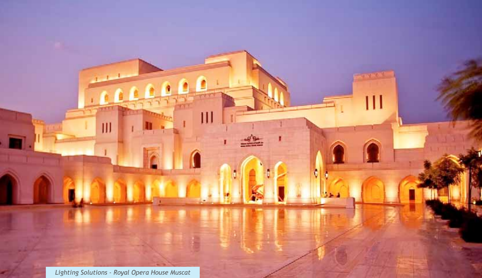
Lighting Solutions - Royal Opera House Muscat