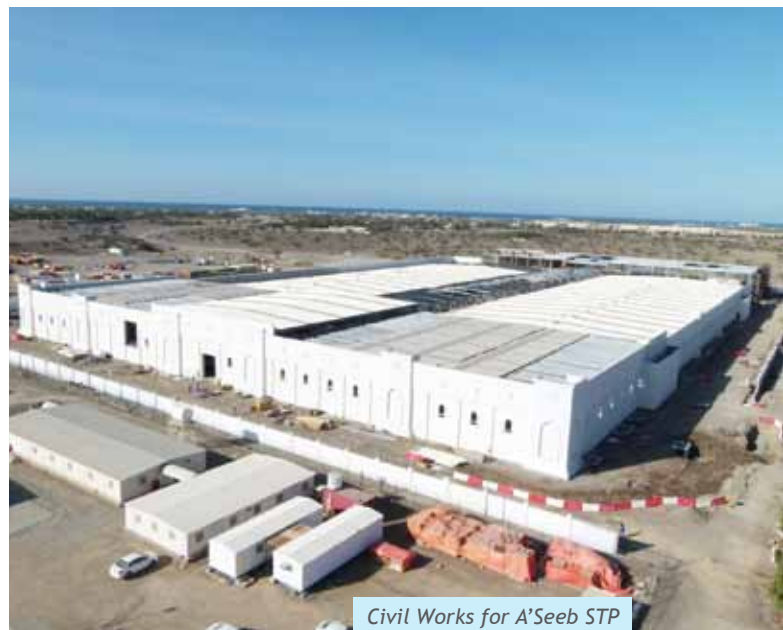
Civil Works for A'Seeb STP

To cater to diversified projects, AHEC has made substantial investment in its own plant, equipment and vehicles. The extensive fleet of 1000+ unit includes Lifting equipment, Tankers, Trailers, Earthmoving equipment, Pipe-laying equipment, Concrete Batching Plant, Stationary equipment and heavy duty vehicles and trucks.