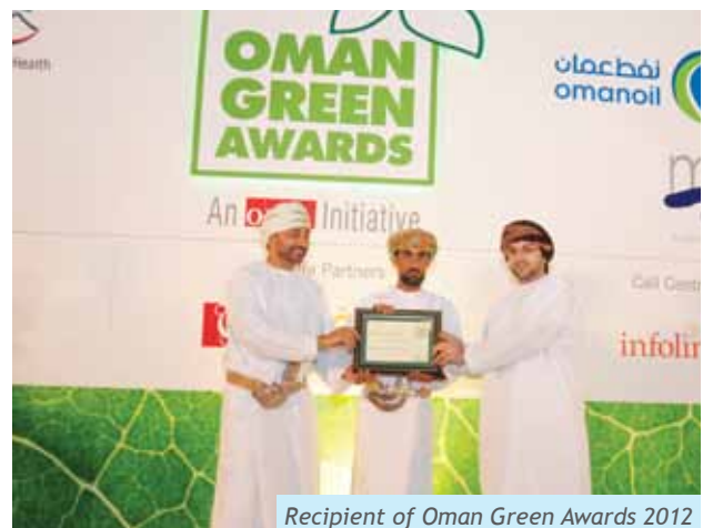
Recipient of Oman Green Awards 2012