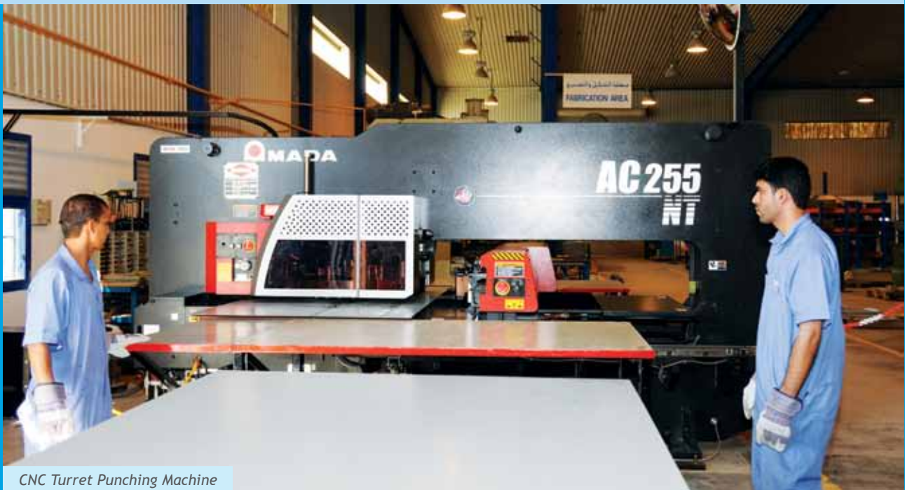
CNC Turret Punching Machine

Al Hassan Switchgear Manufacturing Co. LLC Al Hassan Power Industries LLC