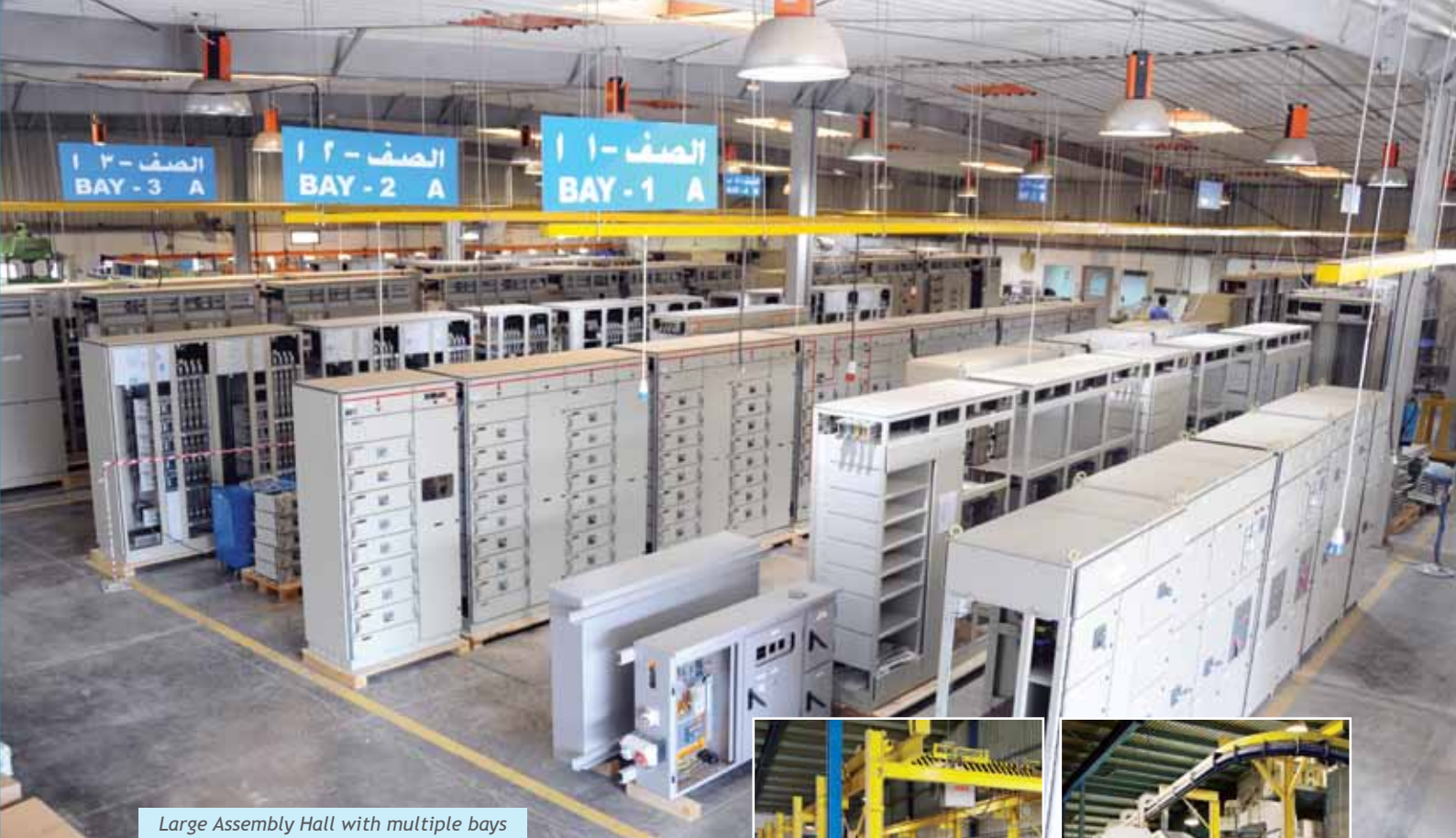
Large Assembly Hall with multiple bays