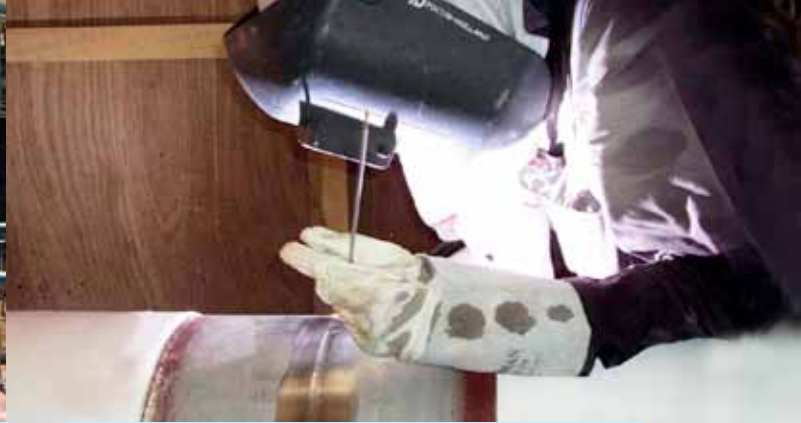
Welding Solutions : Burhan and Kauther pipeline projects