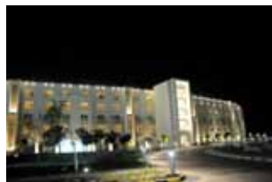
Asian Beach Games - Lighting Solutions

Oil & Gas, Power & Water: Salalah Methanol Project, 1000 MW Sohar Aluminium Smelter Power Plant, Various Sub-station Projects, A'Seeb STP