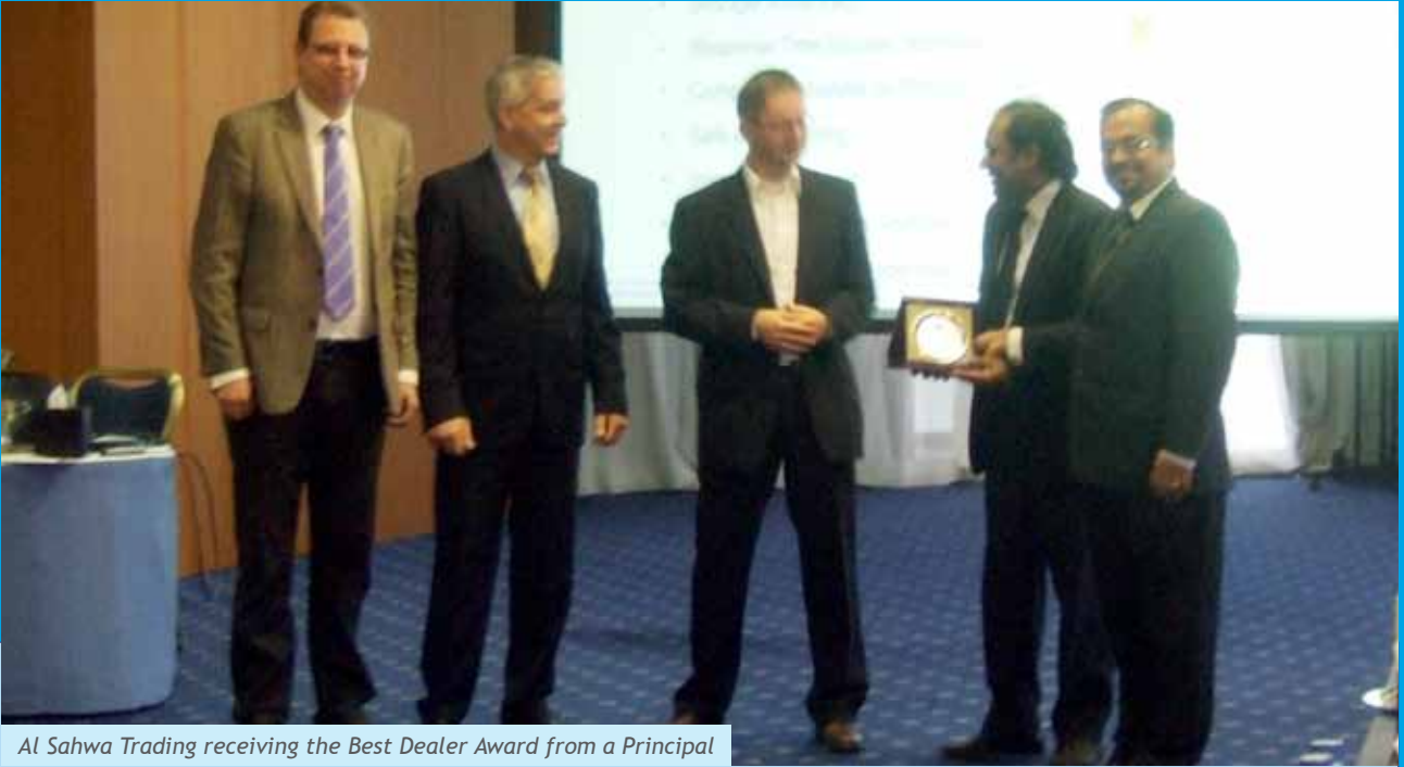
Al Sahwa Trading receiving the Best Dealer Award from a Principal