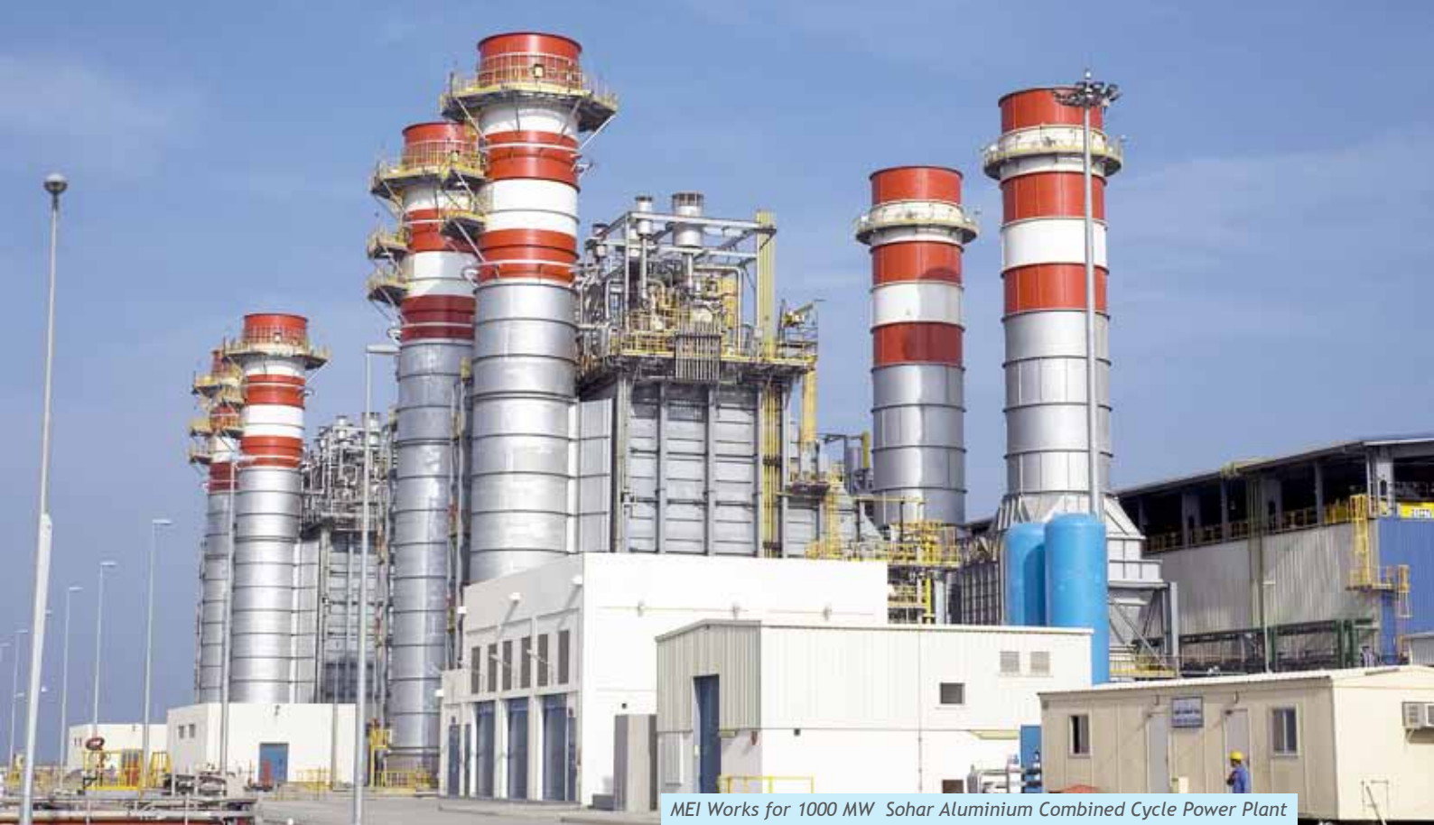
MEI Works for 1000 MW Sohar Aluminium Combined Cycle Power Plant