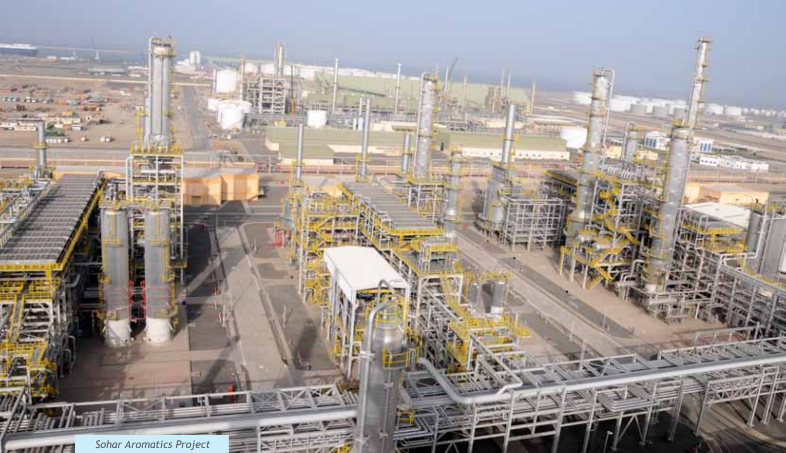
Sohar Aromatics Project