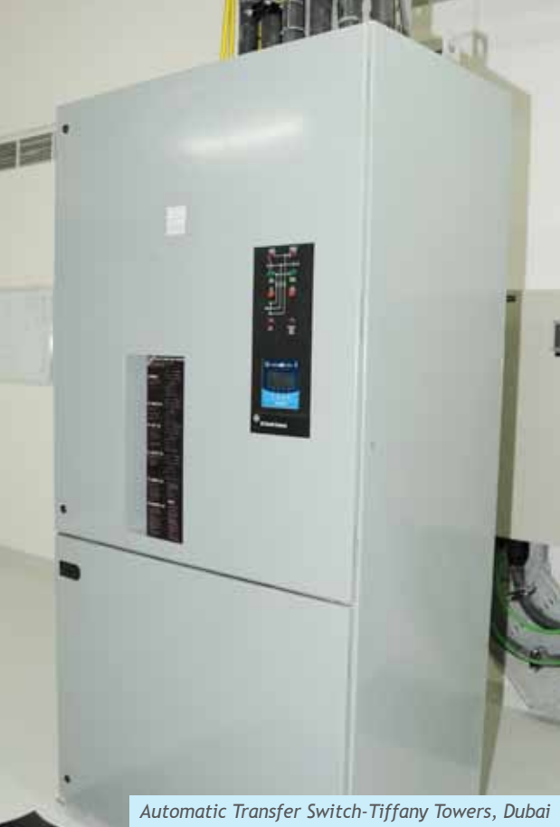
Automatic Transfer Switch-Tiffany Towers, Dubai