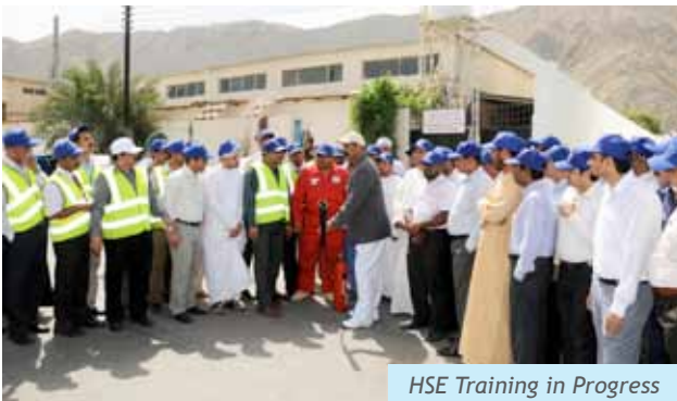
HSE Training in Progress