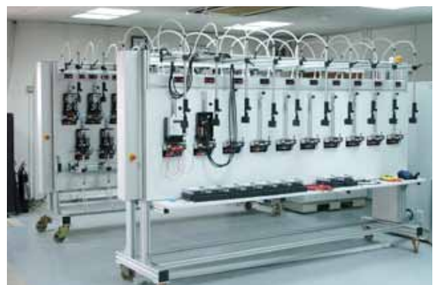
Energy Meter Test Benches - DEWA

Al Hamas has built an impressive list of clients across Utilities, Building Construction Projects, Industries, EPC Contractors and Dealer Network