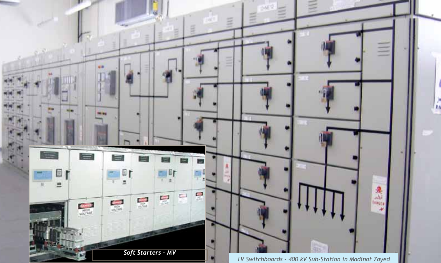
Soft Starters - MV