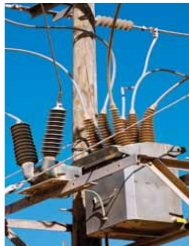
Auto Reclosers - PDO Project

PDO's Power Plants (Saih Rawl, Hubara, Qarn Alam, Mukhaizna, Amal), Muscat International Airport, Barka Power and Water Desalination Plant, Seeb Wastewater Treatment project, Sohar Industrial Port, Daleel Petroleum, Dhofar Power Company, Muscat Electricity Distribution, Rural Area Electricity, Mazoon Electricity, Majan Electricity, Ministry of Housing, Public Authority for Electricity & Water (PAEW).