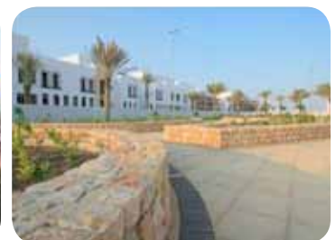
The Wave Muscat