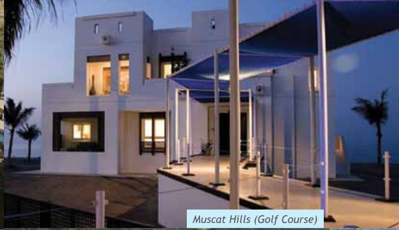
Muscat Hills (Golf Course)