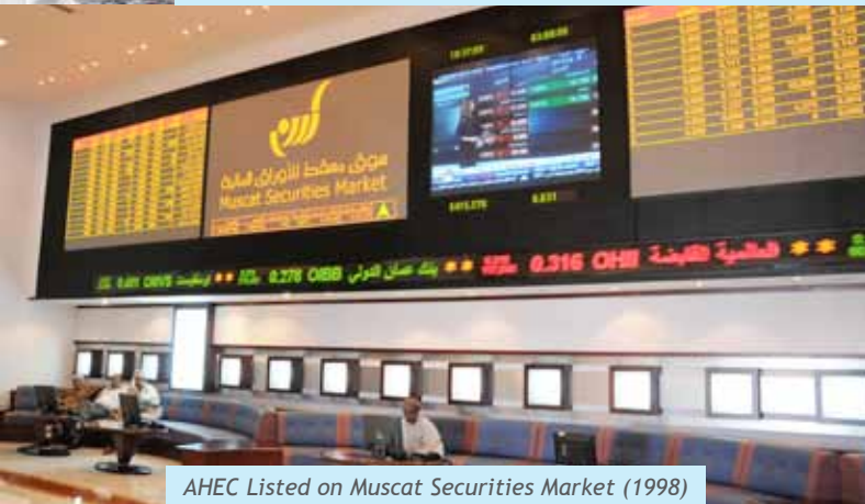
AHEC Listed on Muscat Securities Market (1998)