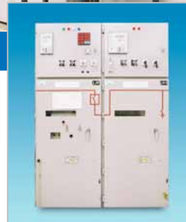
6.6 KV Switchboard

Al Hassan has established a strong client base for its Medium Voltage Panels in Oman.