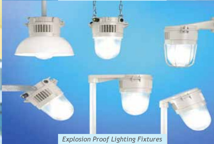
Explosion Proof Lighting Fixtures