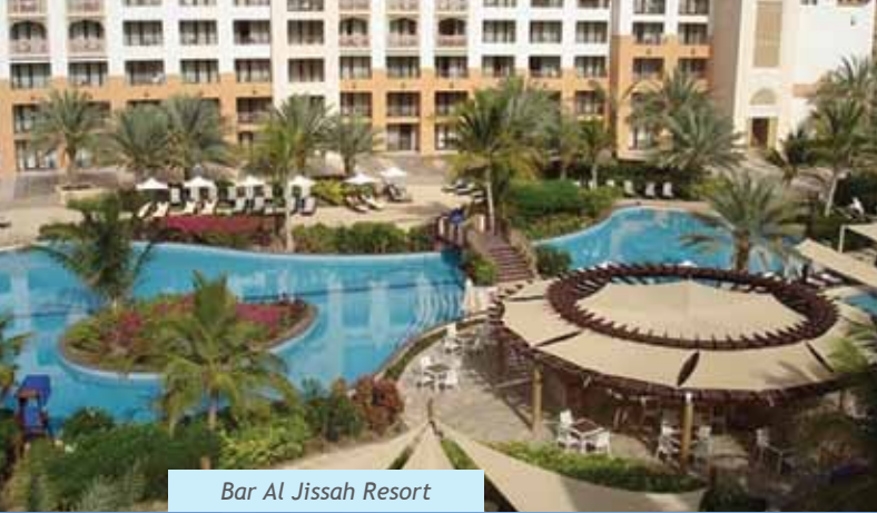
Bar Al Jissah Resort