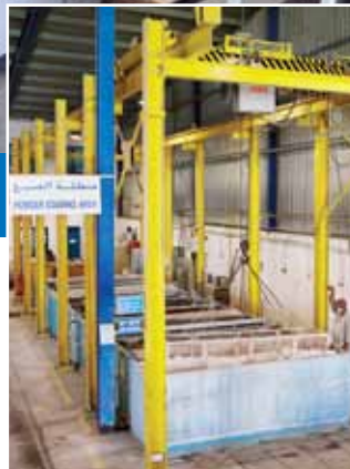
7 Tank Pre-treatment Process

Al Hassan Switchgear has also won a number of appreciation letters from its customers.