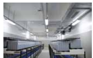
PDO Explosion Proof Lighting