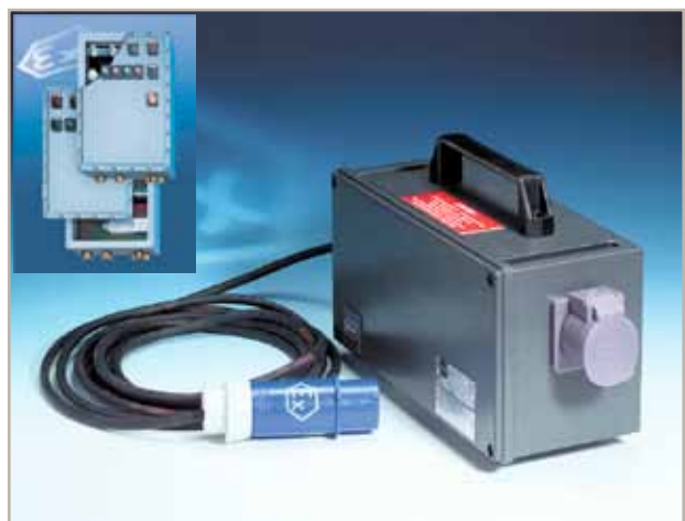
Explosion Proof Products