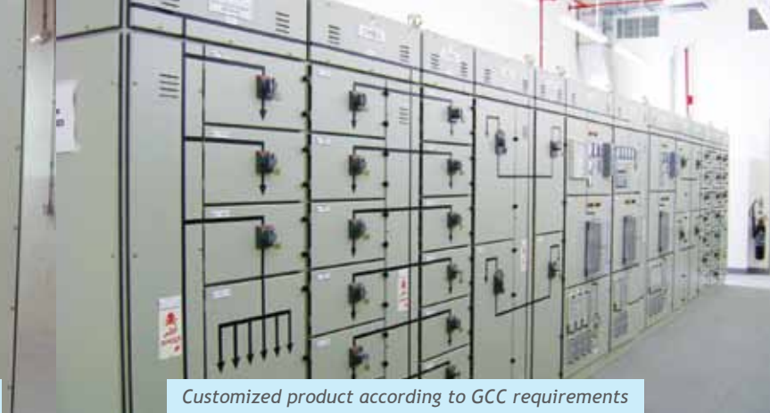
Customized product according to GCC requirements