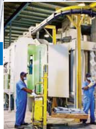
High Precision Painting Shop