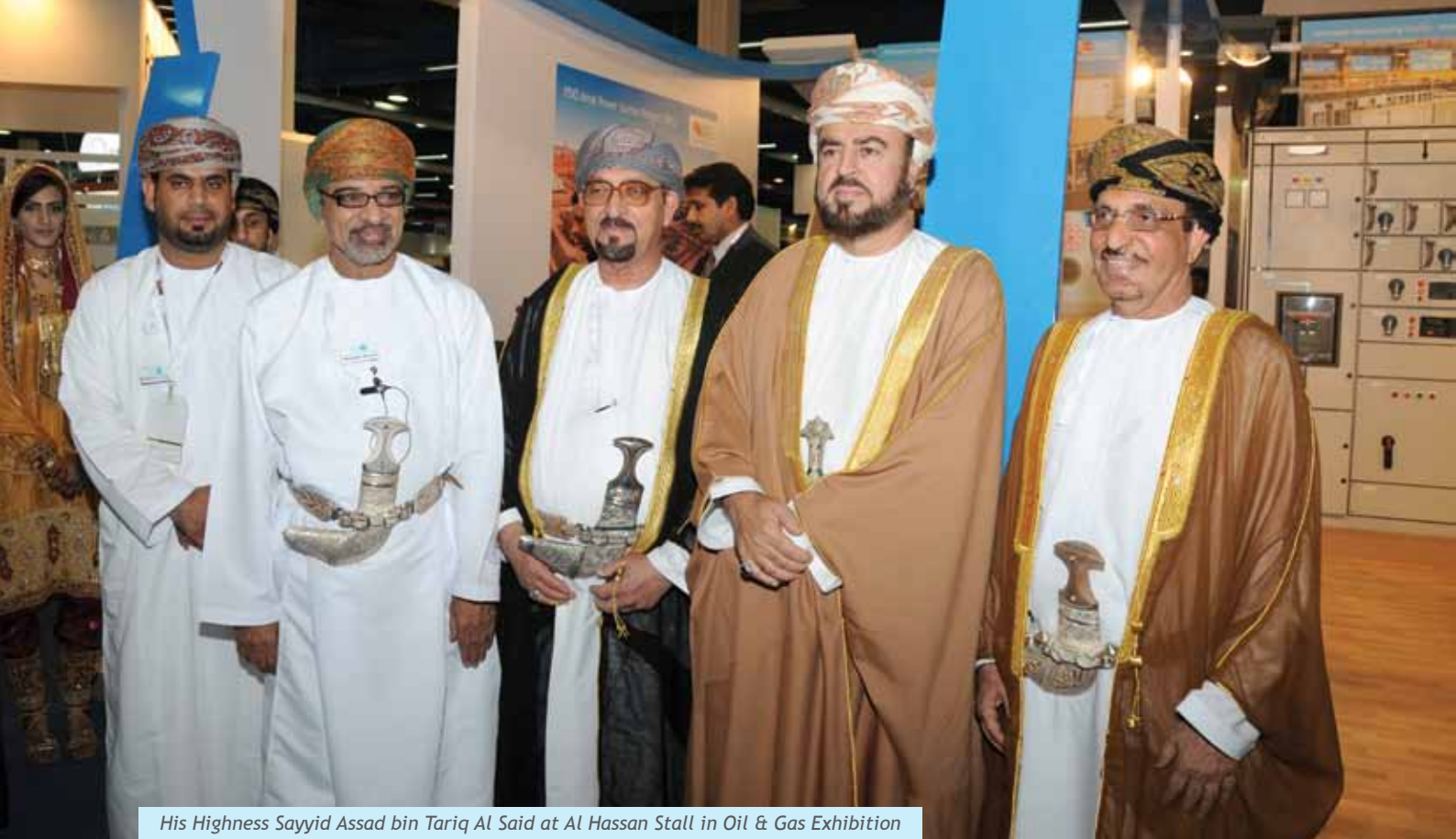
His Highness Sayyid Assad bin Tariq Al Said at Al Hassan Stall in Oil & Gas Exhibition