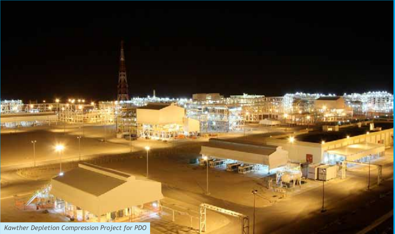
Kawther Depletion Compression Project for PDO