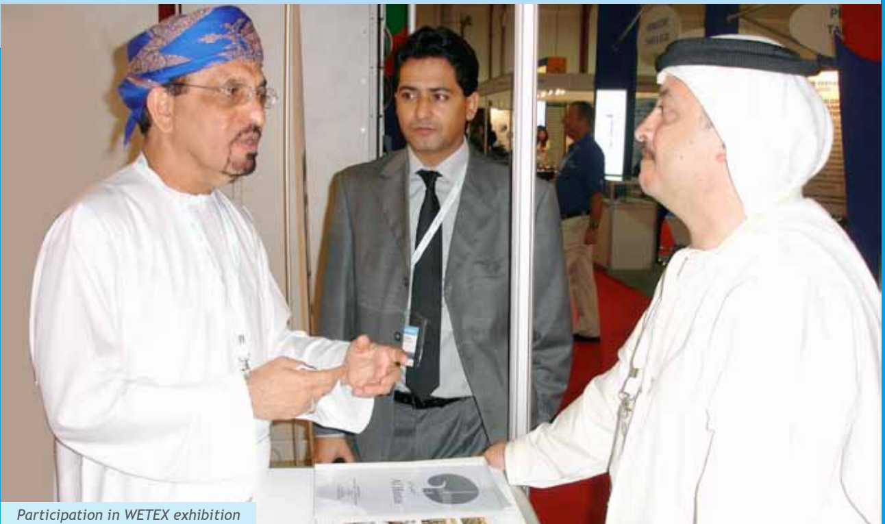
Participation in WETEX exhibition

Al Hamas Trading Company LLC, Dubai Noor Al Khaleej Trading Company LLC, Abu Dhabi Al Sahwa Trading Company LLC