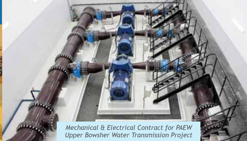
Mechanical & Electrical Contract for PAEW Upper Bowsher Water Transmission Project