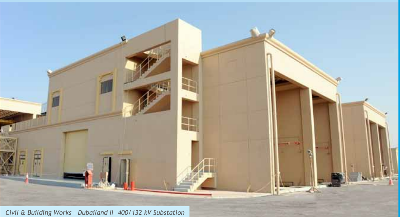
Civil & Building Works - Dubailand II- 400/132 kV Substation

Al Hassan Engineering Co. Dubai LLC Al Hassan Engineering Co. Abu Dhabi LLC Al Hassan Engg. Co. Abu Dhabi (Fujairah Branch)