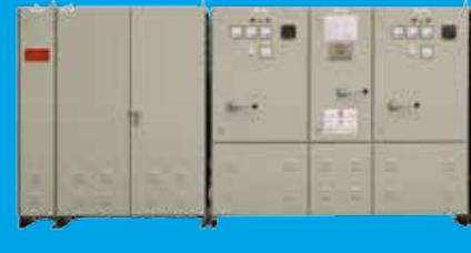
Feeder Control Panel