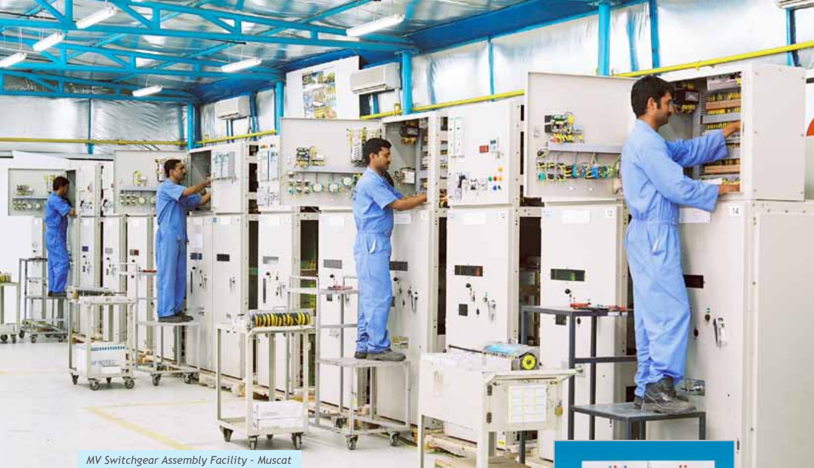
MV Switchgear Assembly Facility - Muscat