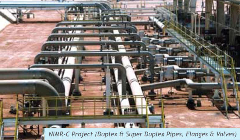
NIMR-C Project (Duplex & Super Duplex Pipes, Flanges & Valves)