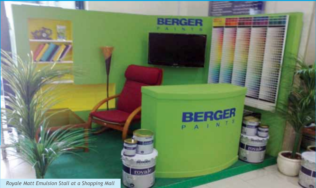
Royale Matt Emulsion Stall at a Shopping Mall