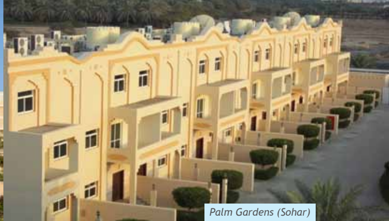
Palm Gardens (Sohar)