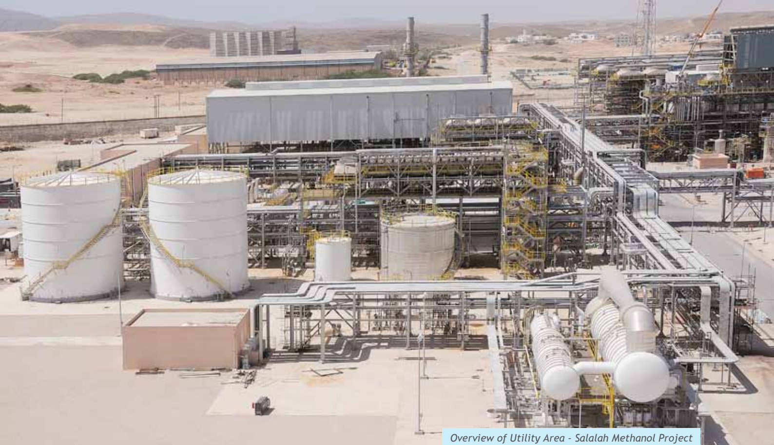
Overview of Utility Area - Salah Methanol Project