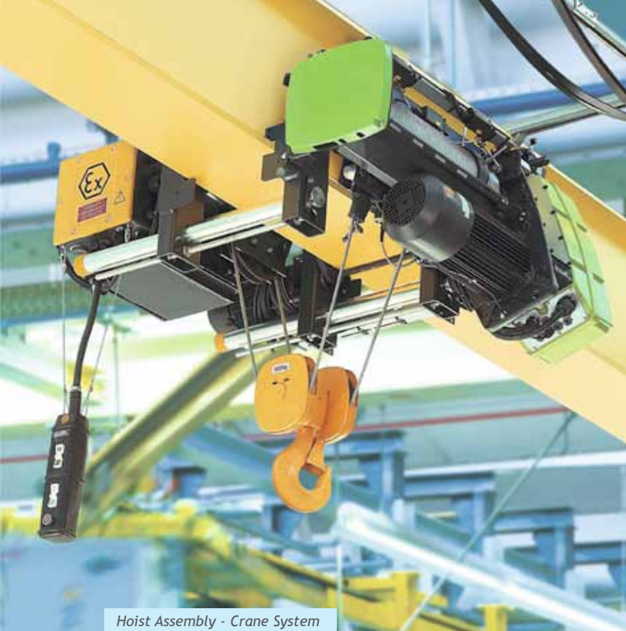
Hoist Assembly - Crane System