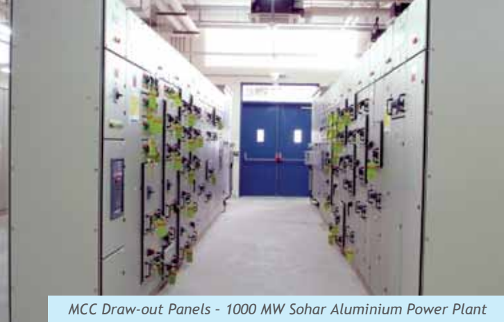
MCC Draw-out Panels - 1000 MW Sohar Aluminium Power Plant