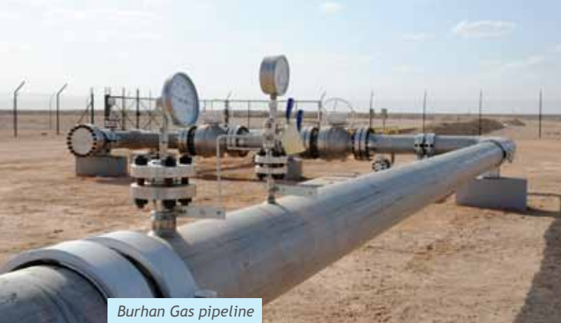
Burhan Gas pipeline