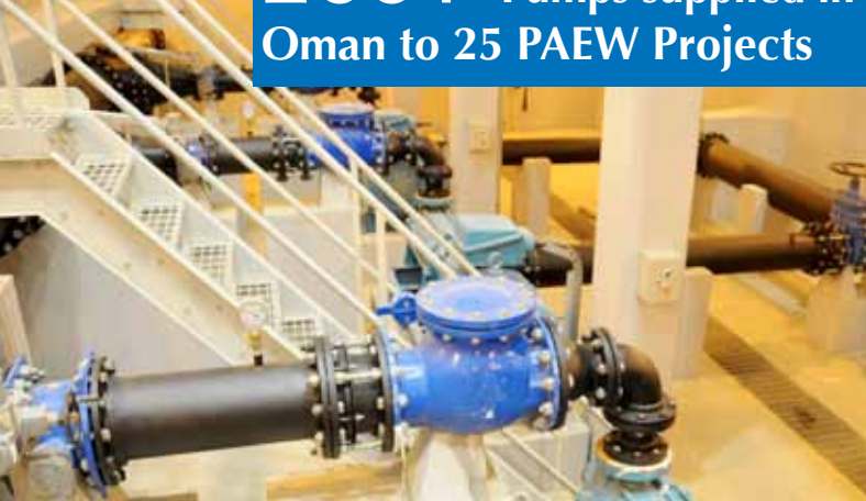
Seawater Intake CW (Cooling Water) Pumping System for Majis Industrial Services (Turnkey)

200+ Pumps supplied in Oman to 25 PAEW Projects