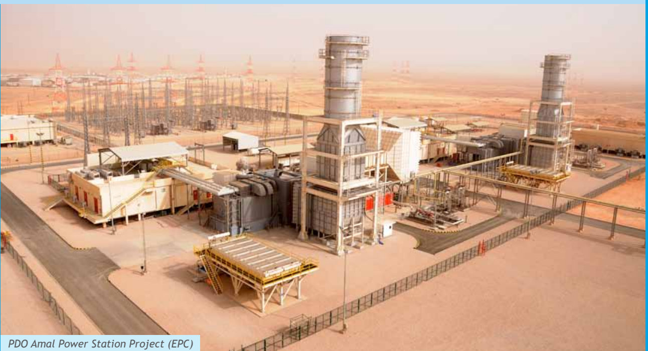
PDO Amal Power Station Project (EPC)