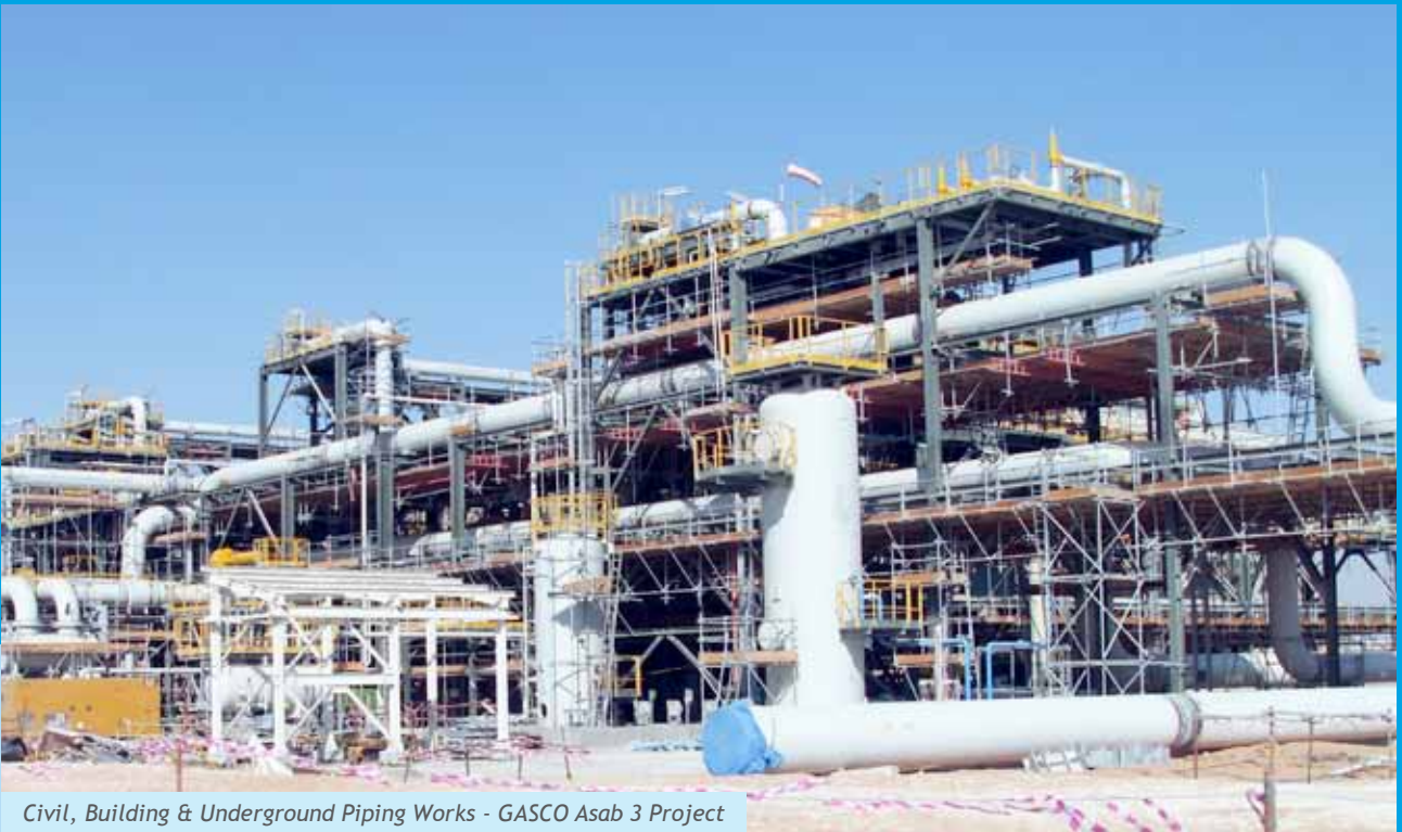
Civil, Building & Underground Piping Works - GASCO Asab 3 Project