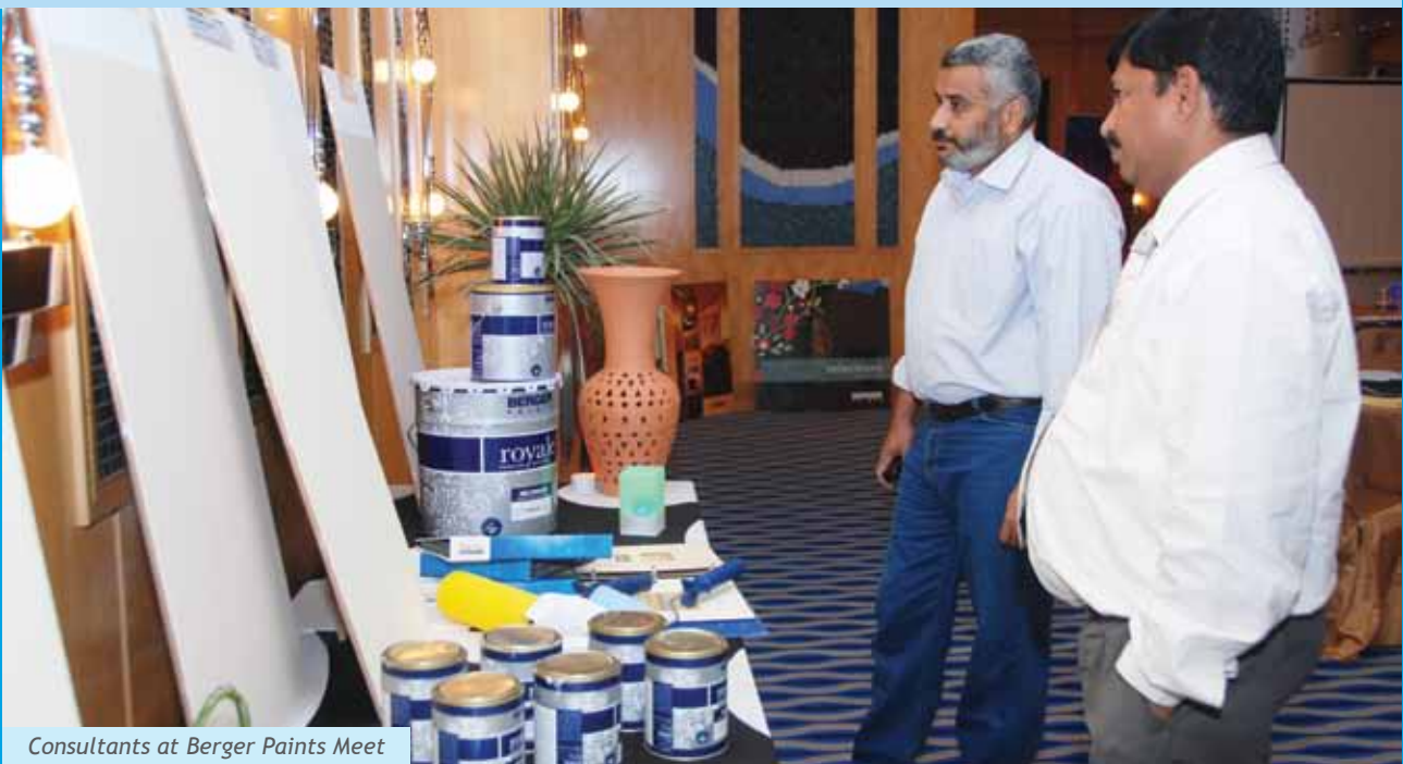
Consultants at Berger Paints Meet

Berger Paints Oman is a joint venture company between the Al Hassan Group, Oman and Asian Paints Limited with its plant at Ghala in Muscat since March 2000.