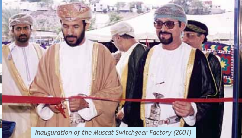
Inauguration of the Muscat Switchgear Factory (2001)