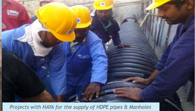
Projects with HAYA for the supply of HDPE pipes & Manholes