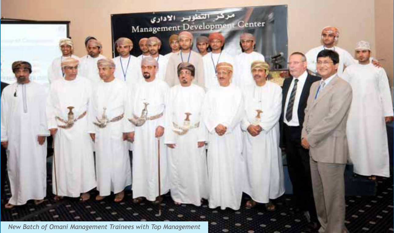
New Batch of Omani Management Trainees with Top Management

The support units are centralized at Head Office and are responsible for specific functional areas and operate in coordination with the respective Strategic Business Units.