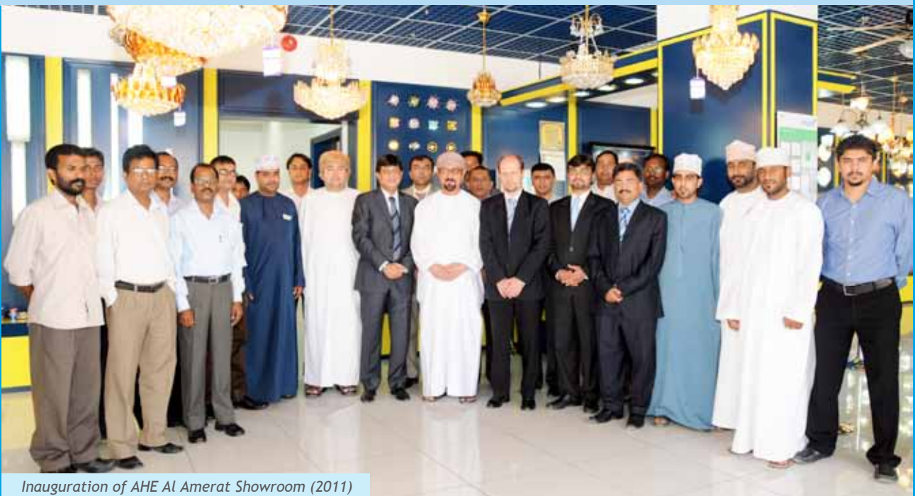
Inauguration of AHE Al Amerat Showroom (2011)

Al Hassan Electricals Company LLC Hi-Tech Services & Supplies LLC