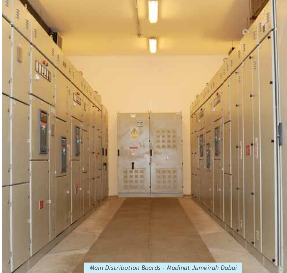
Main Distribution Boards - Madinat Jumeirah Dubai