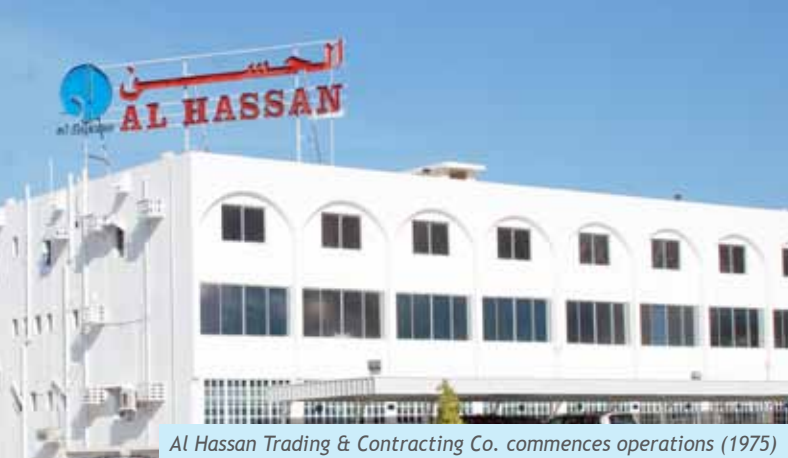
Al Hassan Trading & Contracting Co. commences operations (1975)