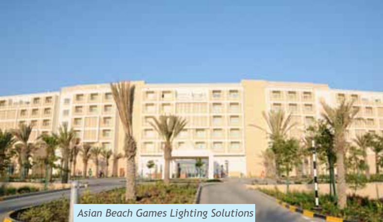
Asian Beach Games Lighting Solutions